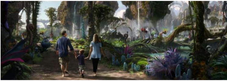
Pandora, The World of Avatar Land