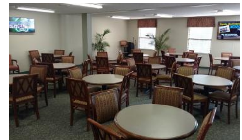
Clockwise from top left: Game Table Area, Pool tables, Ping Pong, Air Hockey; Fun Center Entrance; Mini Golf Course; Kitchen Area; Social Area, Seating and Stage