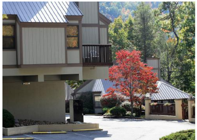
Pedestal loft area before the fire