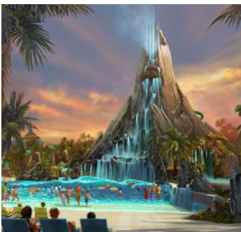
Universal's Volcano Bay

Miss Fortune Falls, is Disney's, Typhoon Lagoon, newest offering in a decade. A new family raft ride due to open as of this writing. This water park will have guests sit in rafts for an extended two minute floating tour through Capt. Mary Oceaneer's (treasure hunter) past and see many of her artifacts.