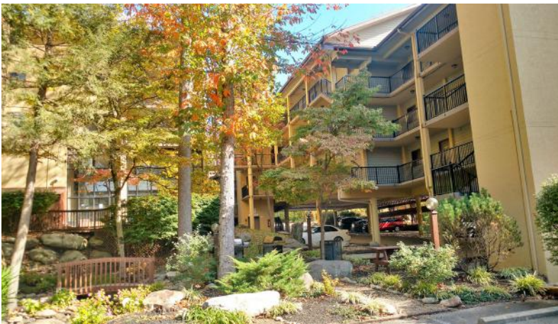
Rear view building 5,6 indoor pool before the fire