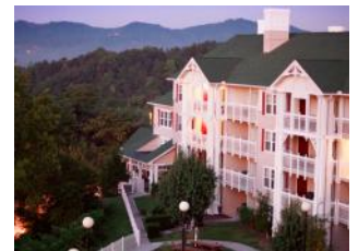
SUNRISE RIDGE RESORT